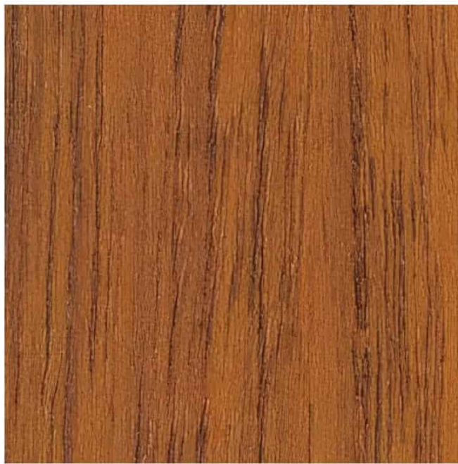
Wood Teak Oil